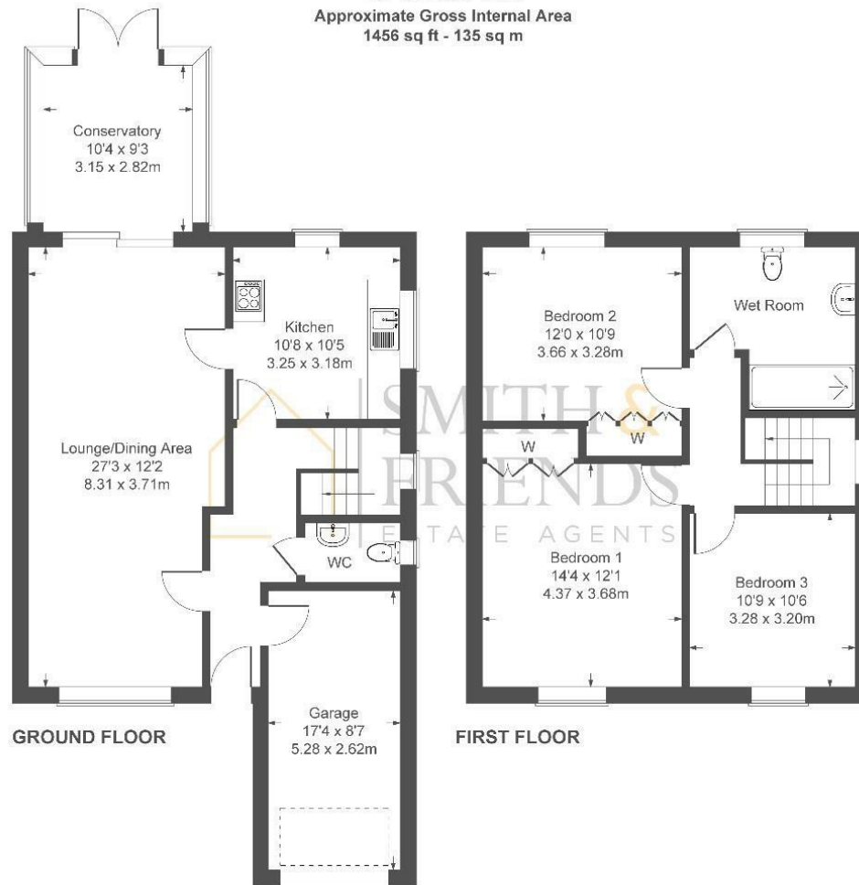
Not to Scale. Produced by The Plan Portal 2026 For Illustrative Purposes Only.

Approximate Gross Internal Area 1456 sq ft - 135 sq m